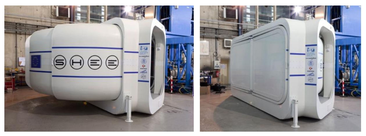
SHEE deployed and folded configurations; credit: SHEE Consortium, photo: Bruno Stubenrauch, 2015

In total, six petals automatically deploy from within the main body of the habitat. The six petals are divided equally into two groups and are symmetrically aligned on the central axis within the stowed habitat.